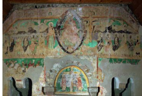
*Left (il. 21) Last Judgement, Muestair Monastery, western wall, Swiss, around 800 C.E.; - without Hetoimasia