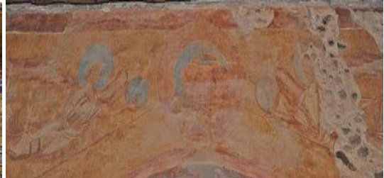
*Left (il. 42) The Empty Throne, Santa Prassede, The Chapel of Saint Zenon, 9 th century, Rome;