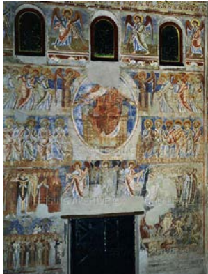
* Right (il. 22 ) Last Judgement, St. George Church, western façade, Reichenau-Oberzell, Germania, 11 th century;