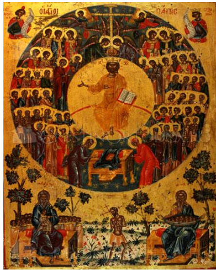
*Left (il. 18) Andreas Ritzos (1421 Iraklio - 1492), Ascension of Christ with the Hetoimasia, 15 th century, Tokyo, National Museum of Western Art;