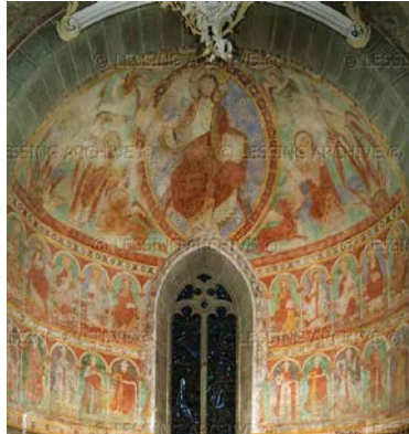
*Left (il. 23) Last Judgement, Sant Angelo in Formis Church, Capua, 1072-1078; - without Hetoimasia