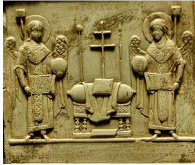
*(il. 20) Byzantine ivory plaque, detail Hetoimasia, Inscription above the throne (middle top): HETOIMASIA, with The Angels Mihail and Gavriil, and four saints: St. Dimitrie, St. Teodor, St. Gheorghe, St. Procopie, Constantinople 1000 CE - Louvre Paris;