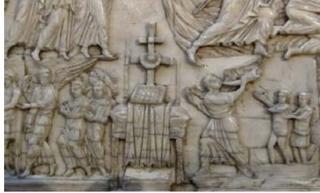
*(il. 27) Last Judgement, detail Hetoimasia, Constantinopol, ivory plaque, London Victoria & Albert Museum, 1000-1100 CE; 38