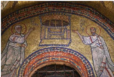
*Right (il. 41) The Throne with the Lamb, Santa Prassede of Rome, 817-823;