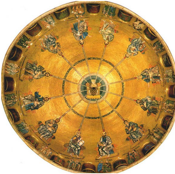
*(il 14) The empty throne or hetoimasia, surrounded by the twelve Apostles, Basilica San Marco, Venice 11 th century;