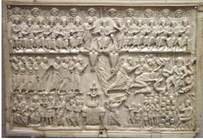
*Right (il. 26) Last Judgement, St. Trinity Church, Makariev Monastery, Rusia, 17 Century;