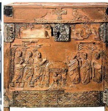
*Left (il. 31) The sarcophagus of Tusculum, with the monogram of Christ and His robe seated on the empty throne, IV century;