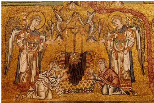
*(il. 28) Last Judgement - inlaid, Hetoimasia s detail, St. Maria Assunta Cathedral, Torcello, 11 th - 12 th Century;