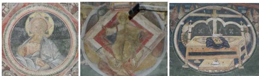
*(il. 50, a, b, c) The same rainbow surround God and Hetoimasia, but Jesus Christ is sitting on the rainbow, Exonartex, Probota Monastery, Romania, 16 th century;