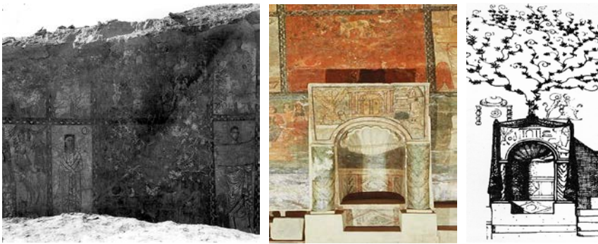
(il. 30) Dura Europos Synagogue, west wall: central panel; first reconstruction after Goodenough 22

This aspect exhibits an eschatological connotation because of the place of the location (above the niche for storing the Torah), but also because of the symbols with which it's corroborated (the vineyard – central, the altar – on the left side, and the empty throne – on the right side; under the throne, in the centre, the scene “Abraham’s sacrifice” – all of them arranged in such a way that form a symbolic program, a well-outlined one, which comes to enforce the idea that the Jews were still expecting Messiah here, on earth, and of the future things of the world that will come, idea that emerges in reality from the entire program of Dura Europos’s representations 21 .