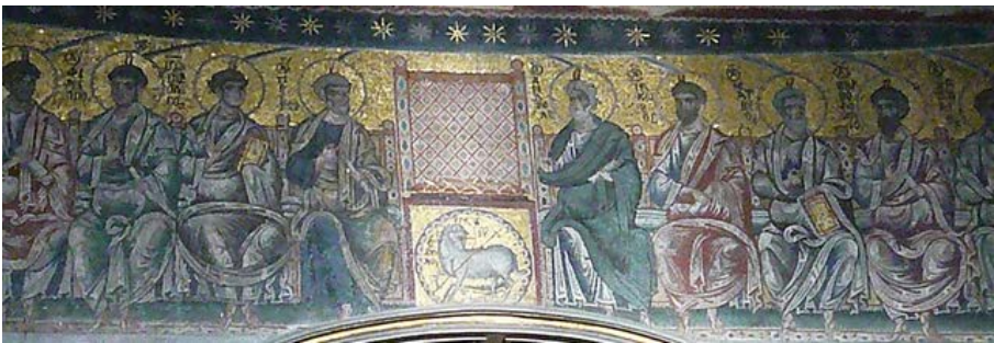
*(il. 15) The Triumphal arch with Hetoimasia, Santa Maria di Grotta Ferrata Monastery, Italy, 12 th century;