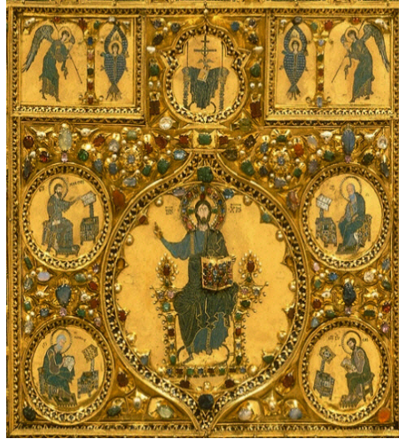
*Left (il. 16) Russian Reliquary of the true cross with Hetoimasia, Constantinople (1075-1125 CE) St. Petersburg Hermitage;