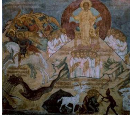
*Left (il. 25) Last Judgement –al fresco, Notre-Dame de l'Assomption Church, Alsacia, Bas-Rhin, Rosenwiller 14-15centuries; - without Hetoimasia