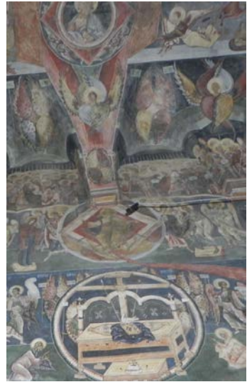
*Left (il. 48) Last Judgement with Hetoimasia in the middle of composition, panoramic photo, Voroneț Monastery, Bucovina, Romania;