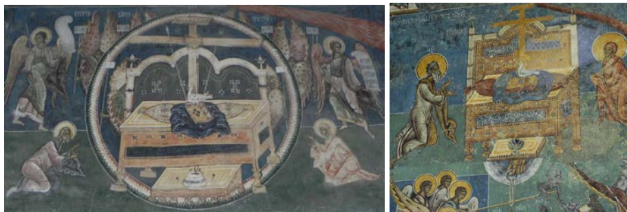
* Left, (il. 1.) Hetimasia's Throne, detail from "Last Judgment" fresco, first half of 15 th century, Probota Monastery;

As a conclusion, we would like to underline the fact that even if the term of "Hetimasia", "Hetimasia's Throne," in other words "The Throne of the Preparation" entered the artistic language quite late (around 11 th century), the symbolic elements accompanying the representation of the Empty Throne were reinforcing, starting with the very first representations, the idea of Christ's sacrifice, which prepares the redemption of the humankind, and only based on this redeeming sacrifice, the idea of a Throne for Preparing the Last Judgment, Hetimasia's Throne, has been accomplished. Because of the redeeming Sacrifice of Christ, humankind in general and every man in particular can appropriate for himself the fruits of an objective redemption, each of us working for individual redemption, preparing as such the soul for the Judgment. This throne of Preparation of the Judgment (of Hetimasia), which we have specified it's the Holy Table, at the Judgment time will be transformed in the Throne of the Last Judgment; in other words, the Holy Liturgies which consecrate the believers, preparing them for judgment, will be the measure of the judgment of humankind.