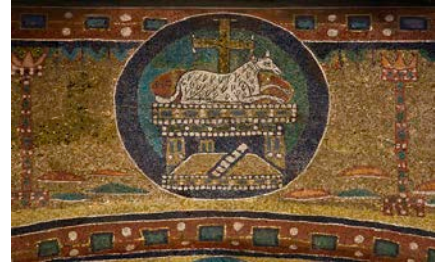
*Left (il. 40) The Throne with the Lamb – Christ bringing Himself as a sacrifice, St. Cosmas and Damian Church, Rome, 6 th century;