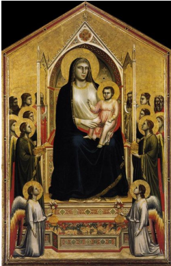
Fig. 11. Giotto, Madonna Ognissanti , 1310.