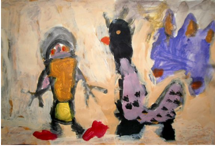
Fig. 9. Illustration for the Romanian folktale The Little Bag, with Two Coins , drawing by Catrina, 5 years old.

visual size is shown most strikingly by our habitual obliviousness to the constant change in size of the objects in our environment brought about by changes in distance” 6 .