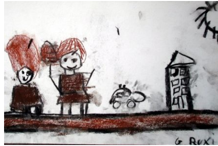
Fig. 10. The City , drawing by Ruxandra, 5 years old.