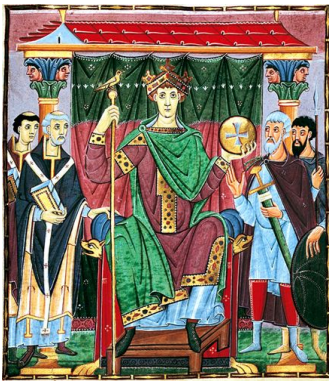
Fig. 7. Otto III , image from an illuminated manuscript, cca. 1000

better than in any other European country. The representations that are typical to this region were influenced by the Mozarabic adornments, which are characterised by a pronouncedly linear, yet very colourful decorative style. In the apse of the church of Saint Climent de Taüll , a remarkable example of mural painting, one can notice the obvious two-dimensional character of this style full of rigour, where the line plays a major part, producing an effect that is similar to the one created by stained glass. The principle of the hierarchical perspective can be noticed in fig. 8, where Jesus Christ dominates the composition through His dimensions. The evident anti-naturalist intention and the subtle geometrisation of shape are the main elements that highlight the two-dimensional character of the image.