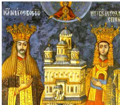
Fig. 6. The votive portrait of Neagoe Basarab, Curtea de Argeș Monastery, 16 th century

As previously stated, the hierarchical perspective as a method of visual representation is also present in the Western European Pre-Romanesque and Romanesque art and it can be identified in mural and panel painting or in manuscript illumination. The presence of this type of perspective in the Romanesque art can be explained through the influences of the Late Antique and Byzantine art. The method is used both in religious and laic works. In the next image (fig. 7), one can notice the same principle of enlarging the size of the king in comparison with the characters from his entourage. Although stylistically different from the Byzantine art, the image reminds of the mosaics of San Vitale in Ravenna.