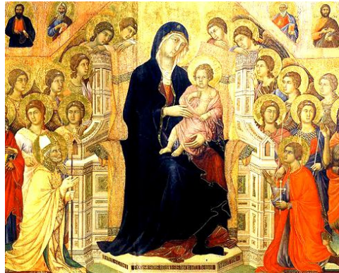
Fig. 12. Duccio, Maestà , 1308-1311.

The hierarchical perspective is also present in the work of some artists considered to be precursors of the Italian Renaissance, such as Giotto (fig. 11), Duccio (fig. 12) and others. In his work, Madonna Ognissanti , Giotto uses the hierarchical perspective, as well as a type of instinctive linear perspective. The Virgin is painted on a bigger scale than the other characters, who are less important in the context of the representation. At the same time, Giotto approximates the nearness of the characters in the foreground, who are located in front of the others, represented at a smaller scale. This slight sensation of spatiality is suddenly contradicted by the flat golden background, in Giotto's case this is a reminiscence of Byzantine painting.