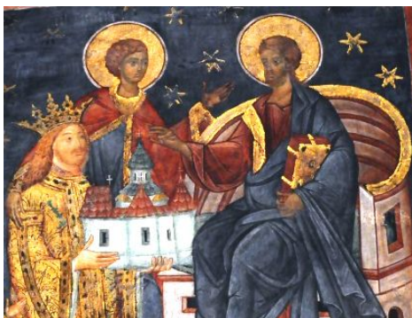
Fig. 5. The votive portrait of Stephen the Great, Voroneț Monastery, Romania, 15 th century

Furthermore, in Byzantine art, the proportions between the characters and the furniture or buildings do not comply with the visual perception. There are many images where people can be as tall as a building or where they can hold an edifice in their hands, the latter being the case of the church founders in the votive portraits (see figs. 5 and 6). Rudolf Arnheim argues that this example shows “how size differences arise in response to considerations of meaning, e.g., when the relation between creator and creature or saint and emblem is to be expressed” 5 .