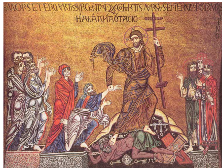
Fig. 4. Descent into Hell , Saint Mark's Basilica, Venice, 11th century

The principle of the hierarchical perspective can be very well observed in the scene of The Crucifixion (fig. 3), a simple composition with three characters that is representative for the 11 th century iconography. The figure of Christ dominates the composition, due to its size. Virgin Mary and John the Apostle, much smaller than Christ, reticently share His sufferings. The symbolic importance of Christ crucified is emphasized by placing the action in an unreal, transfigured space. The figures seem to be floating in