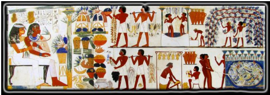
Fig. 2. Scene from the tomb of Nakht, Thebes, 18 th Dynasty, cca. 1400-1350 BC

These representation standards governed the Egyptian art for more than 3,000 years, offering it the clarity and generalisation level that we can identify today as belonging to modern art. It was only during times of restlessness and social disturbance that proportion canons and painting had to suffer stylistic alterations.