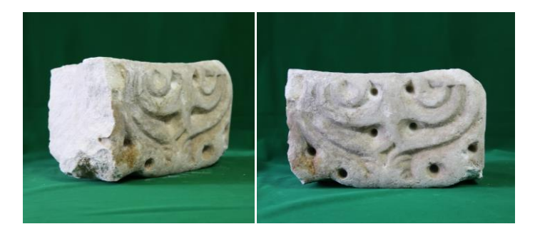
Fig. 4. Marble item from the funds of the Church and Archaeological Museum of Holy Metropolis of Abkhazia (New Athos). Limestone.

The forth block (fig. 4) is unlike the others by its style and material. It is the only one carved in marble (the frontal part is 27 \times 16 ; the lateral faces are 27 \times 16 and 16 \times 17 ), decorated with a stylized plant ornament resembling the ornament carved on the capital of the semi-column of the lost Deesis slab.