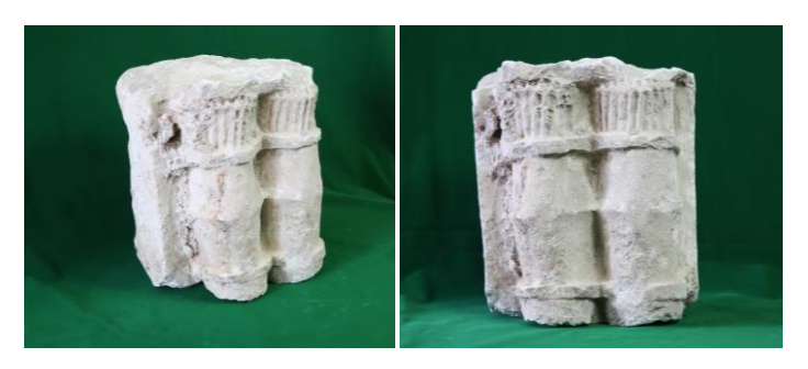
Fig. 3. Fragment of architectural decoration from the funds of the Church and Archaeological Museum of Holy Metropolis of Abkhazia (New Athos). Limestone.

The fragment with a similar decoration has also been stored in the Abkhazian State Museum before its reconstruction <sup>27</sup>. Furthermore, three identical fragments are exposed in the narthex of Dranda church.