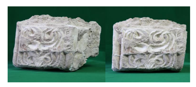
Fig. 1. Fragment of carving from the funds of the Church and Archaeological Museum of Holy Metropolis of Abkhazia (New Athos). Limestone.

Metropole of Abkhazia in New Athon monastery<sup>24</sup>. The first of them (fig. 1), a limestone block of rectangular shape (a frontal part is 220 \times 18 cm; lateral parts are 23 \times 18 , 16 \times 15 ,5 cm, 16 \times 16 cm), probably made a part of the altar barrier. Its frontal part is decorated with a stylized plant ornament. It reminds us of the motif that decorates the capital of the pilaster separating Christ from the Virgin on the second slab published by Uvarova.